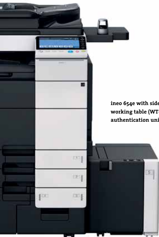
ineo 654e with side paper deck (LU-301), working table (WT-506) and finger vein authentication unit (AU-102)

The ineo 654e prints and copies at 65 A4 pages per minute (ppm). That means your staff can leave this machine to get on with any high-volume job while they carry on with their daily office work. In the multi-user environment of a departmental device or centralised office location and at an in-house printshop, this will also eliminate job queues, or at least shorten waiting times. Since this machine prints or copies in duplex mode at full speed, it will also save you money by reducing your paper consumption on high-volume jobs.