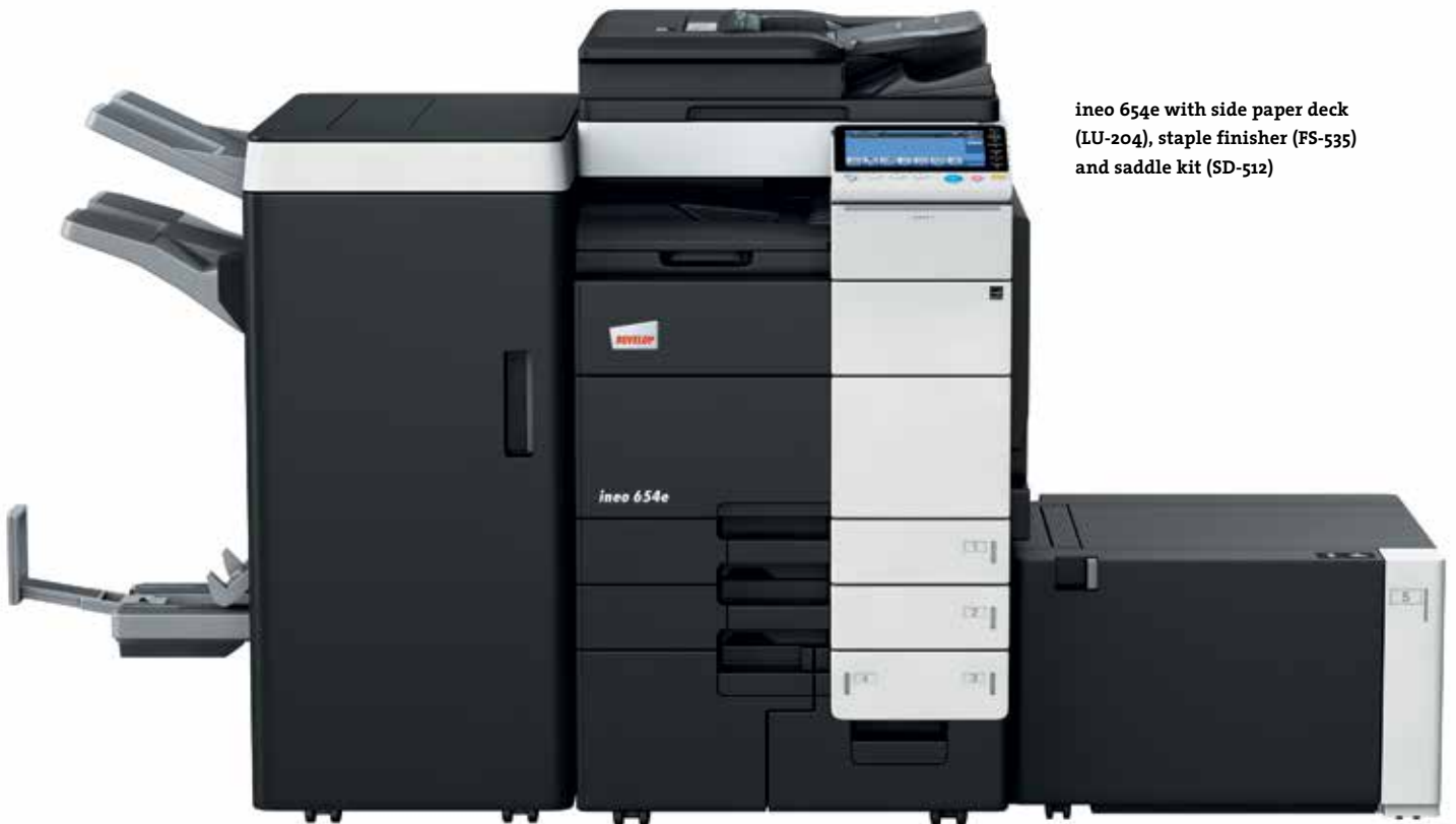
ineo 654e with side paper deck (LU-204), staple finisher (FS-535) and saddle kit (SD-512)

Viruses, Trojan horses, hacker attacks: these days, no business can afford to ignore the challenging issue of IT security. That's why the ineo 654e is certified to ISO 15408 EAL 3, the industry's security standard for multifunctional systems. What's more, it also comes equipped with numerous data-security features such as IPsec encryption, which ensures secure communication channels for all documents passing through your company's network. There is no danger of confidential documents or data getting into the wrong hands either since access to the system can be restricted to authorised users by means of the standard hard-disk encryption kit and authentication technology. This way, we ensure your sensitive data stay secure – now and in future.