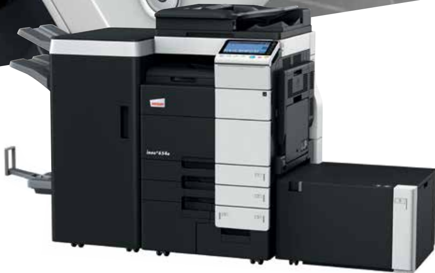
ineo+ 654e with staple finisher (FS-535) and large capacity tray (LU-204)