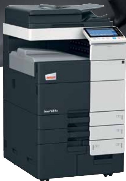
ineo+ 654e with output tray (OT-503)